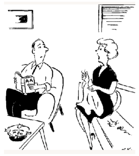
"You don't say! They wrote a whole book about you?"

The delegate's report on the general conference proceedings this year be a potluck of Districts 1, 4(us), and 15. Location TBA.