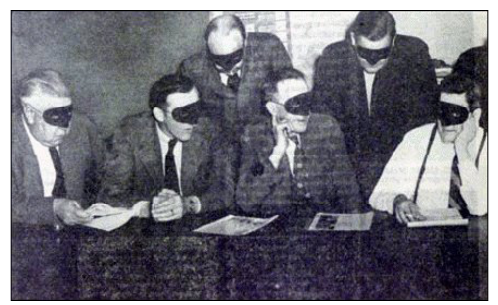
Members of a Cleveland, Ohio A.A. group donned Lone Ranger masks for a newspaper interview in the 1940s.