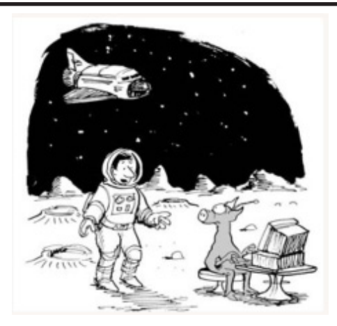
"Hi, you emailed that you need a ride to a meeting . . ."

The benefits include not being shut out if your meeting's supply is exhausted early, getting the issues as much as a week before they are available in print form, and saving the organization printing costs.