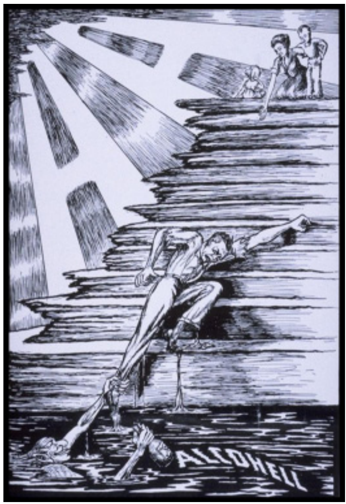
Another of the illustrations for the William White Papers and that site's promotion of a history of Alcoholics Anonymous.