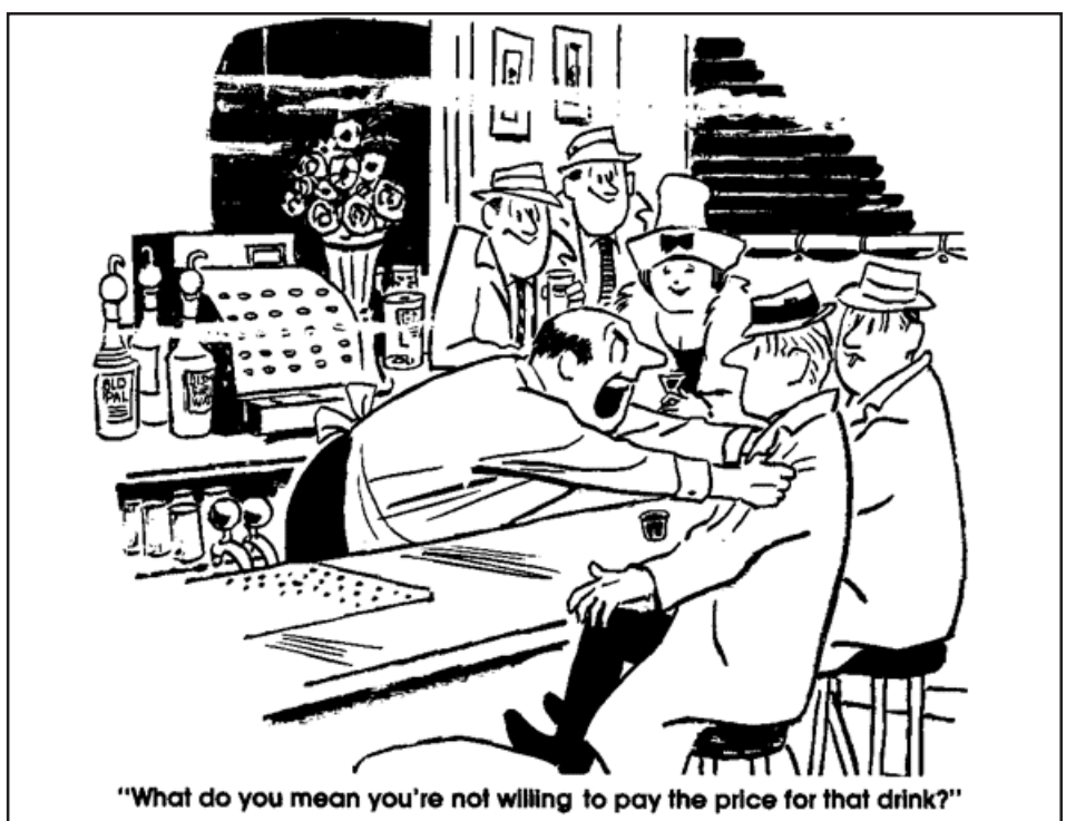
The winning entry in a Grapevine cartoon caption contest.