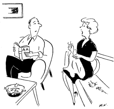
'Let me know when you take your inventory. You'll need my help!'

A. Go back to your home group and get a beginner chip (you won't be the first, nor the last, to 'go out'). There is no permanent cure: only a 'daily reprieve based on our spiritual condition.' Sobriety is like riding a bicycle – you must keep pedaling or you'll fall over. Every day, sobriety/serenity requires_ <u>effort</u> – sometimes a lot, sometimes a little, but <u>always</u> something.